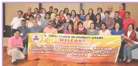
The participants of the Program Assessment and Planning Workshop on Disability Inclusive Programs/ Services for Persons with Disabilities.