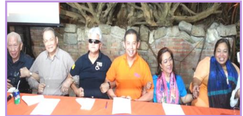
Testimonial Dinner with Cong. Martin Romualdez at Annabel Resto on March 30, 2016.

⇒ Provided technical inputs and lobbied with the Office of Rep. Ferdinand Martin Romualdez, the principal author of the bill, Office of the President and PWD Sector in the crafting/passage of RA No. 10754 “An Act Expanding the Benefits and Privileges of Persons with Disability which was signed into law by the former President Benigno S. Aquino III on March 23, 2016. The law grants persons with disabilities exemption from the 12-percent value-added tax (VAT) on certain goods and services.