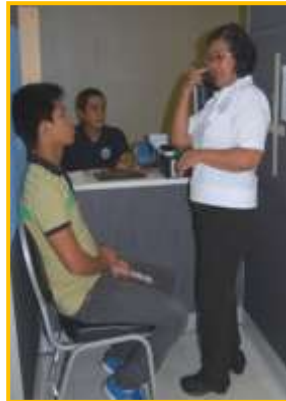
Processing of applications for Passport Application of persons with disabilities

In the President's Message on the NDPR Week celebration, President Aquino affirmed that "nothing can undermine the potential of people committed to progress and that PWDs lead in harnessing this potential, imparting their gifts to promote fairness and equal opportunity in diverse spheres of society." He also expressed hope that the "week-long observance infuses vigor to the cause and allow the participants to synergize their undertakings and distinguish the decade as the period when every Filipino has extended his capacity to build an enabling environment for all."