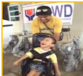
Distribution of wheelchairs in Tacloban City