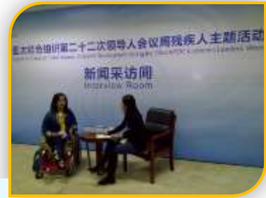
Interview with Chinese Television before the Forum