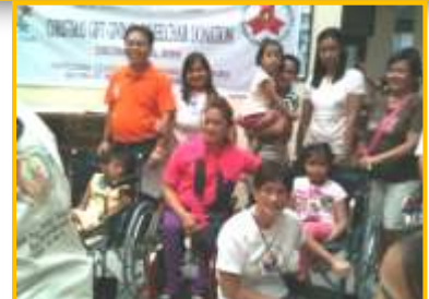
Christmas Gift Giving Wheelchair Donation from Maginoo Shrine Club