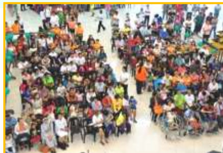
White Cane Safety Day