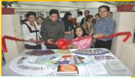
MOA signing and launching of disability sections in SB Novaliches, Library & Info Center and in Pamantasan ng Lungsod ng Maynila Library.