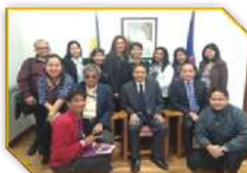
Participants of the Charlton Brown sponsored training in Brisbane, Australia (left) and the DRRM Group during its courtesy call in the Philippine Embassy in Australia.